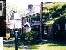
PEARL S. BUCK HOUSE