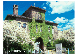
DOYLESTOWN MICHENER MUSEUM